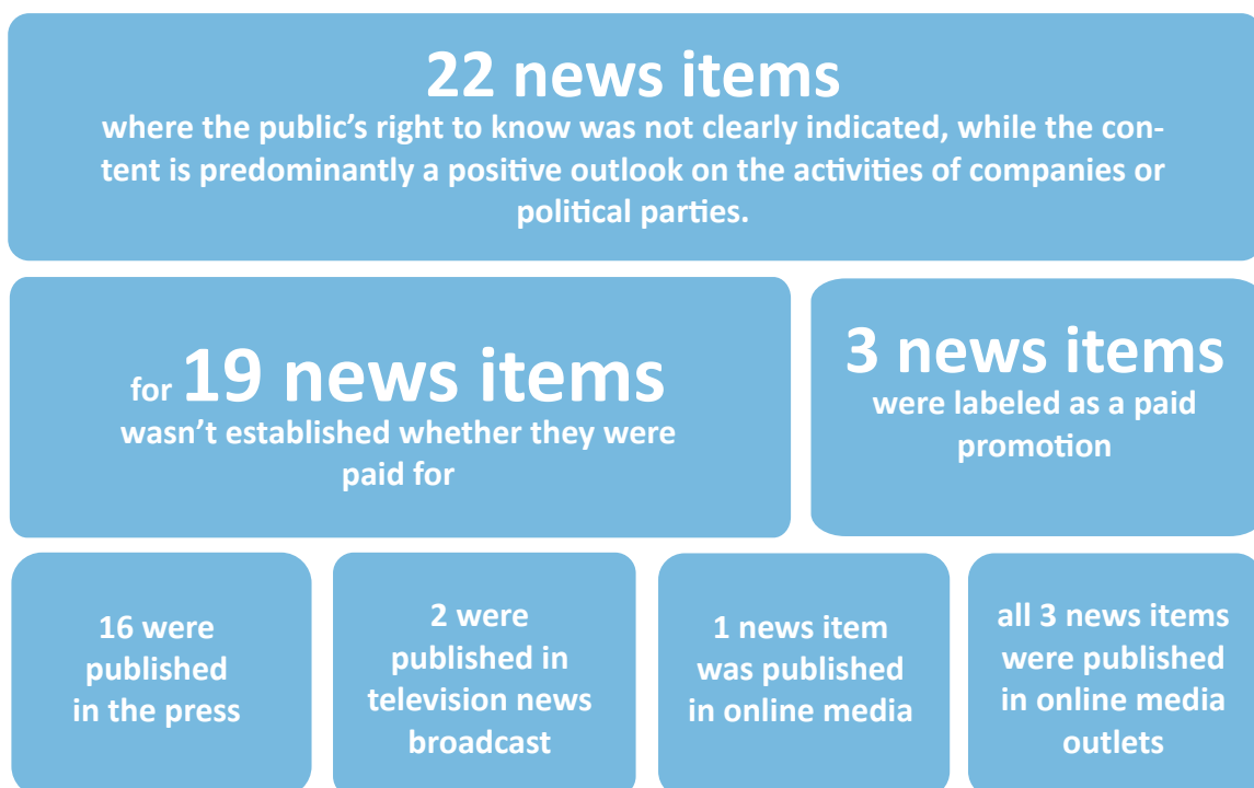
Graph 1: The number and structure of the analyzed announcements

The fact that only two news items were recorded in TV newscasts during the monitoring week is further clarified and complemented by the findings obtained in the survey in which the editors of all newscasts confirmed that they had published information which, in their opinion, was essentially advertisement. Furthermore, the reason for a relatively small number of announcements that appear in the TV newscasts compared to the print media can be attributed to the fact that the TV media are better regulated in this sense, and our respondents from the television media outlets had received warnings and reactions from the Agency for Electronic Media.